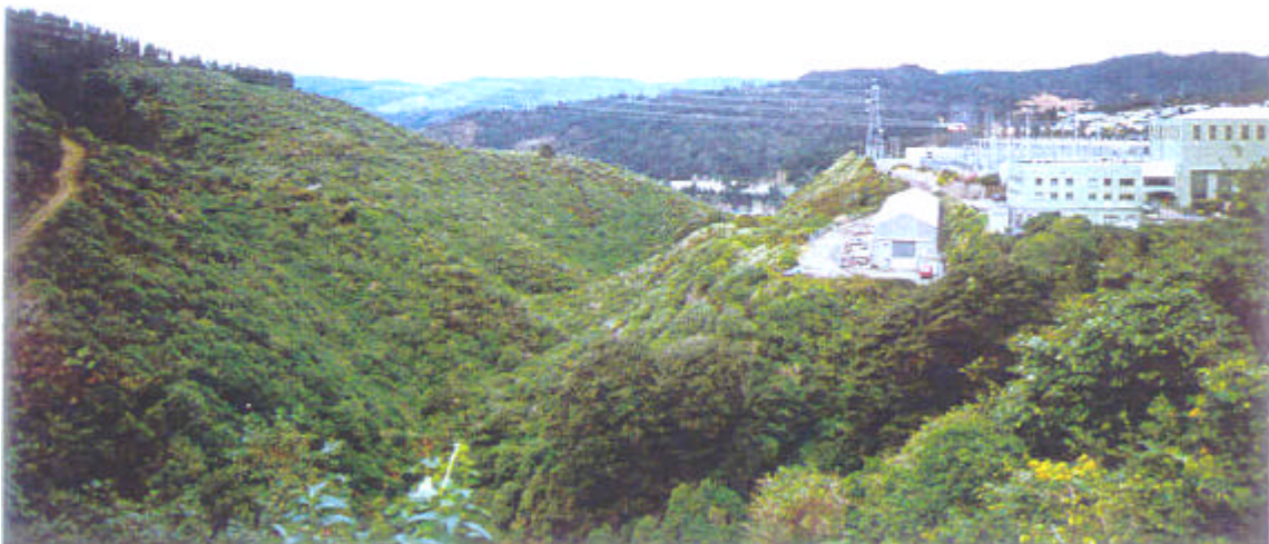
Figure 2 : Steep terrain along Old Haywards Hill Road portion of Water Main (on hillside below Haywards substation).