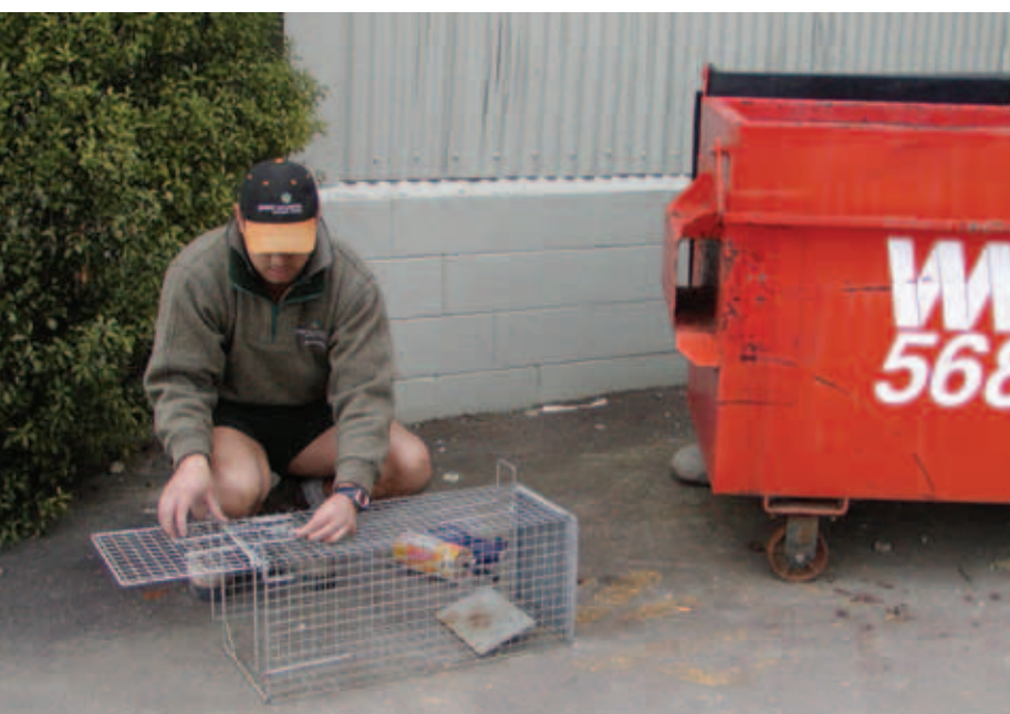
Traps are best set in areas where cats frequent i.e. near food sources

Shooting is an effective method of control in rural areas only. Feral cats can be hunted during the day as well as at night. Cat's eyes shine bright green at night in a spotlight beam. For effective hunting of feral and unwanted cats, concentrate in areas where suitable food and shelter is available for them, such as rabbit-prone land and farm sheds.