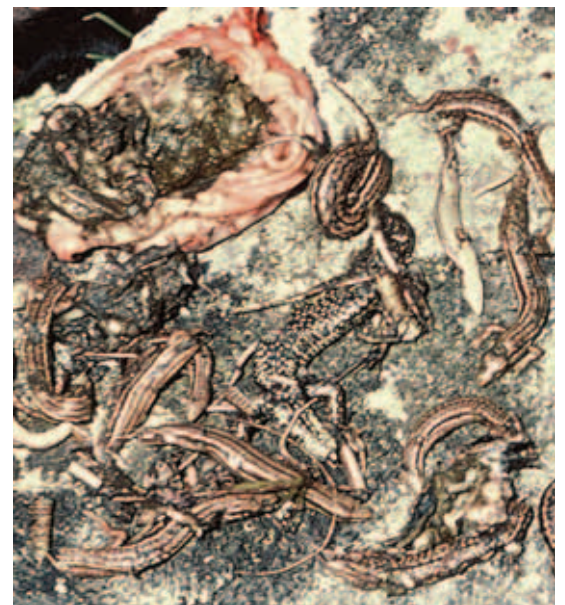
Stomach contents of a feral cat showing 13 undigested lizards

Their prey includes fish, mice, rats, birds, lizards and rabbits. They prefer live vertebrate prey but animal carcasses may be scavenged and large insects taken occasionally.