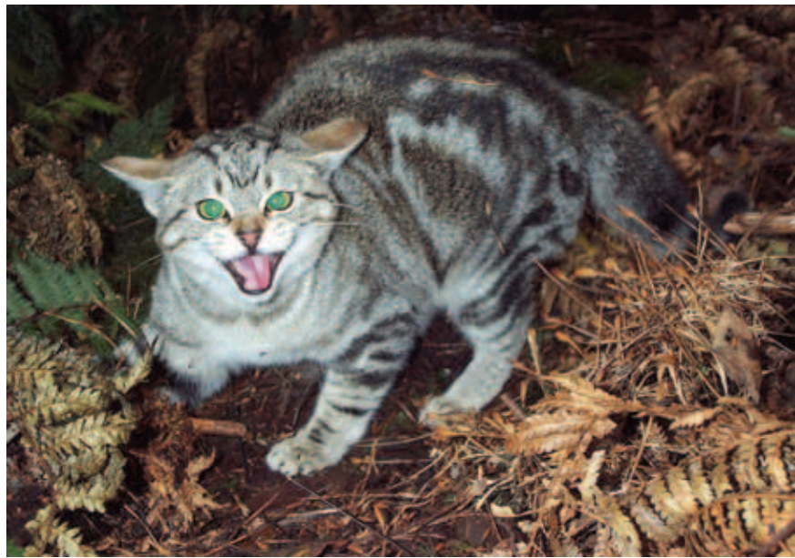
Feral cat in dense bush

Feral cats can be difficult to trap as they are naturally cautious. When using cage traps, it is best to fix the door open for two or three nights until the cat is comfortable entering the trap. Then set the trap. Ensure the traps are set between dawn and dusk as cats are more active at night.