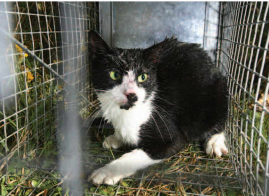
Unwanted cat in cage trap

The house cat, Felis catus , was domesticated in the eastern Mediterranean c. 3000 years ago. Cats were introduced to New Zealand in 1770 by ships carrying the early European explorers. Ships were infested with rats and so carried cats to control them. Despite this early introduction, cats did not become feral until at least 50 years later. They were established in the North Island by the 1830s and in the South Island, by the 1860s. When rabbits became a major problem, the feral cat spread increased because cats were bought in from the cities and released to control rabbit infested farmland.