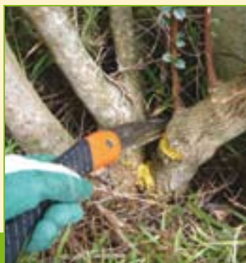
Above: Ringbarking Right: Cutting a trunk

First: cut the trunk of the plant close to the ground with a straight flat cut. The cut must be flat so that the herbicide sits on the cut area.