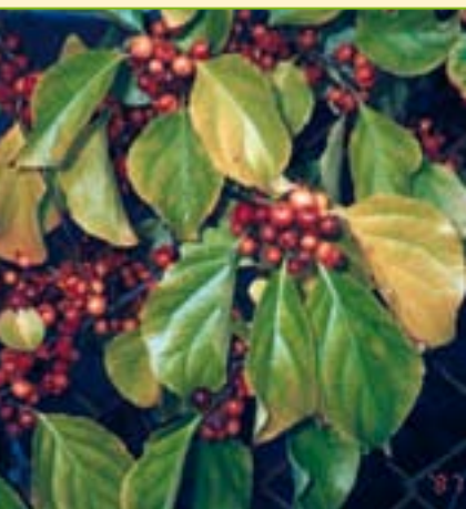
Above: Climbing spindleberry Below: Chilean rhubarb

Look out for weeds new to your area – this includes weeds that are already problems in other parts of New Zealand but are just beginning to appear near you.