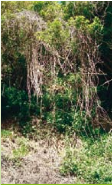
Cut vines left in tree

Cutting and treating stumps works well on single vines or small infestations.