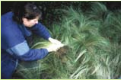
Pulling Mexican feather grass

Pulling or grubbing can be effective for weedy grasses, but only if you have something to replant in their place or can go back regularly to control new weeds or grass regrowth in the cleared area.