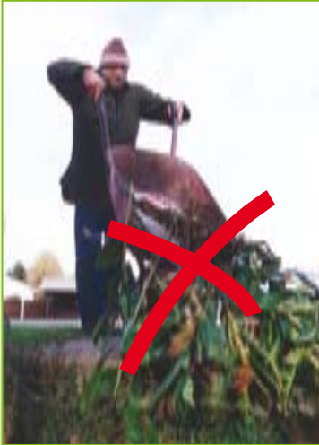
What not to do