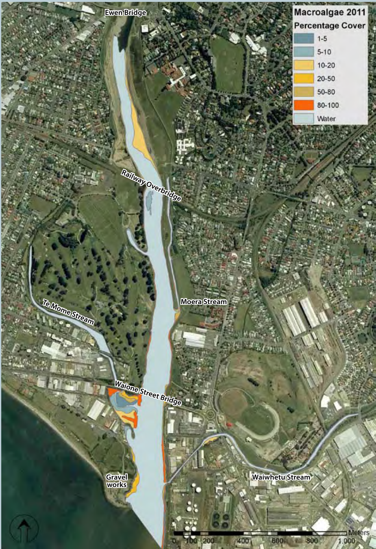
FIGURE 1. MAP OF INTERTIDAL MACROALGAL COVER - HUTT RIVER ESTUARY, JAN. 2011