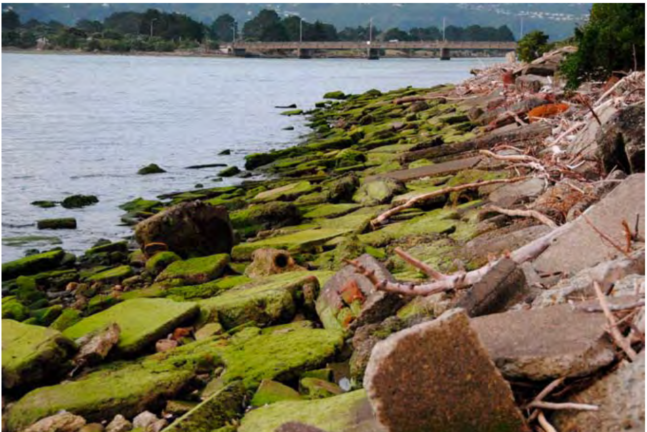
Extensive growths of Ulva intestinalis along the intertidal margins of Hutt River Estuary.