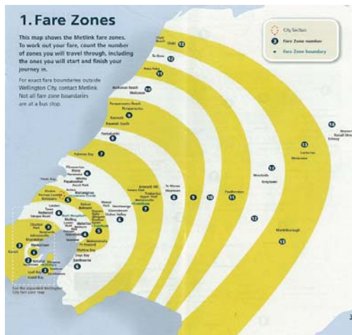
Figure 1: Existing 14 sections/zones