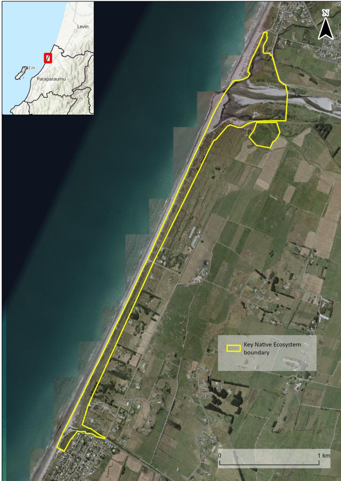
Map 1: The Ōtaki Coast KNE site boundary