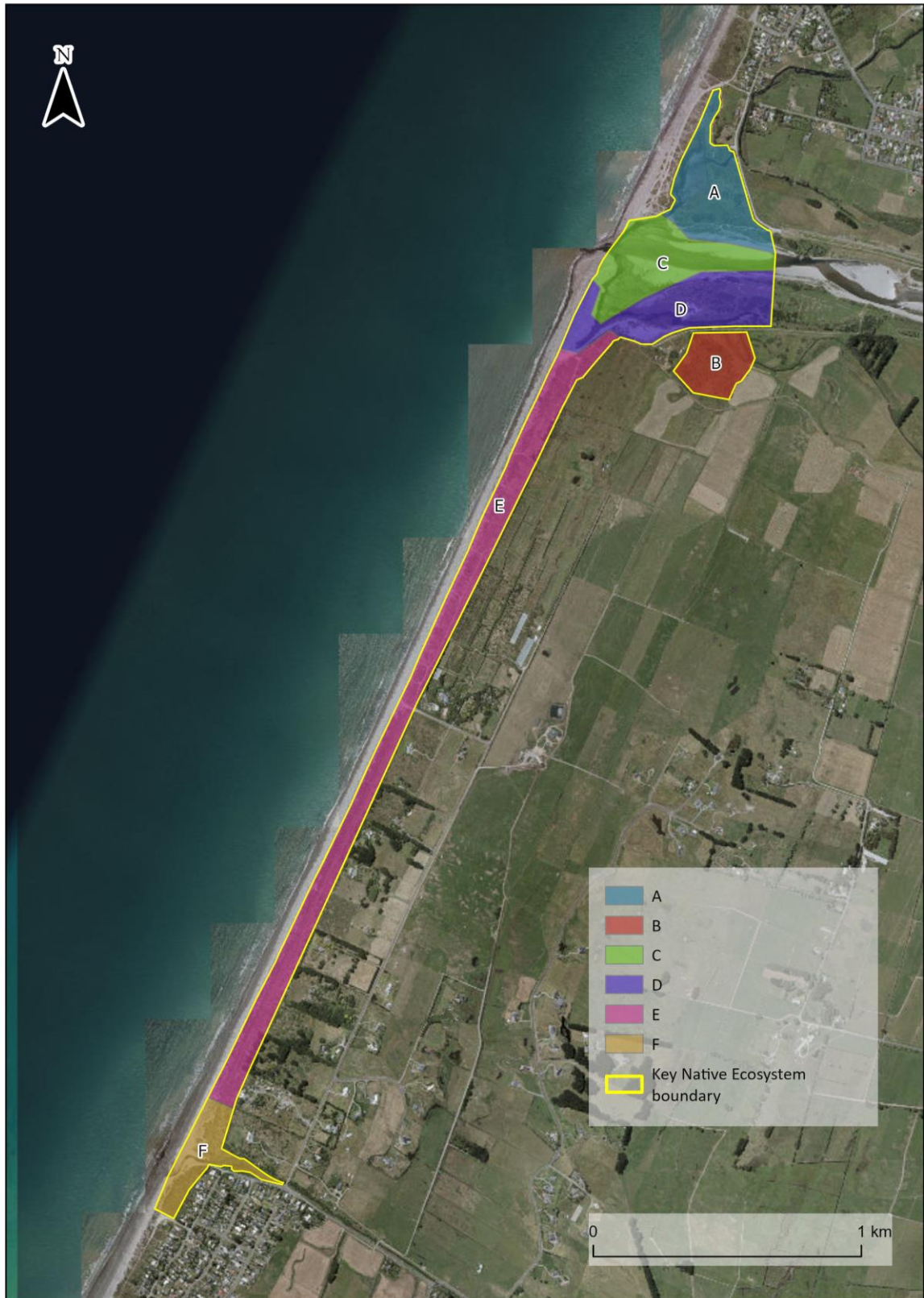
Map 4: Ecological weed control operational areas in the Ōtaki Coast KNE site