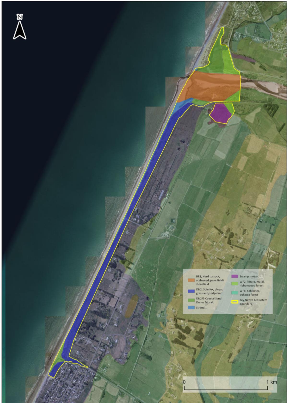
Map 3: Singers and Rogers classification of pre-human forest vegetation types for the Ōtaki Coast KNE site