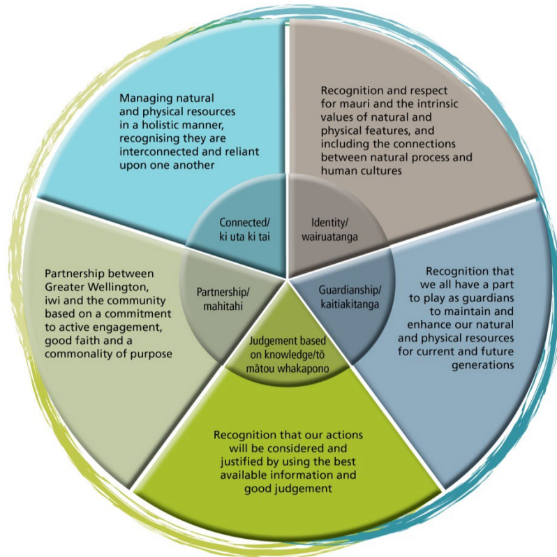
Figure 1.1: Te Upoko Taiao’s principles to guide the review of the regional plans

The make-up of the committee and these guiding principles reflect an understanding that mana whenua, the Council and the wider community all share the responsibility of caring for the region’s environment. Ongoing collaboration between regulators, resource users, mana whenua, the government and the wider community is already in place and can be further built on to manage the region’s natural and cultural resources effectively.