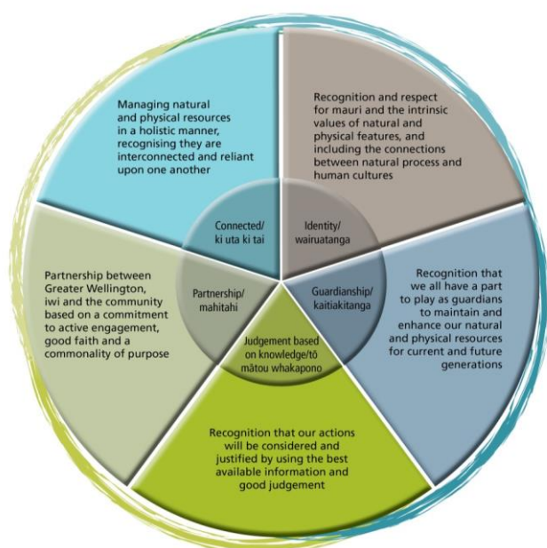
Figure 1.1: Te Upoko Taiao’s principles to guide the review of the regional plans

The make-up of the committee and these guiding principles reflect an understanding that mana whenua, the Council and the wider community all share the responsibility of caring for the region’s environment. Ongoing collaboration between regulators, resource users, mana whenua, the government and the wider community is already in place and can be further built on to manage the region’s natural and cultural resources effectively.